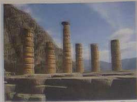
The remaining columns of the Temple of Apollo in Delphi