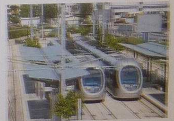
Athens modern trams