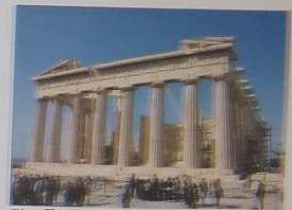
The Parthenon on the Acropolis of Athens

Athens is a city which attracts tourists so transport is very important. There are three metro lines underground and in the streets you can use about 4 000 buses, 14 000 taxis. Inhabitants of Athens use tramways and trolleybuses a lot too. There are 140 theatres (even more than in London). Athens is a birthplace of many famous people, e.g. Platón, Greek King Constantin I. etc.