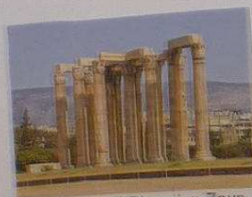
Temple of Olympian Zeus