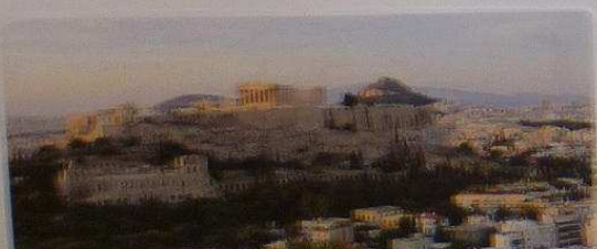
Acropolis of Athens