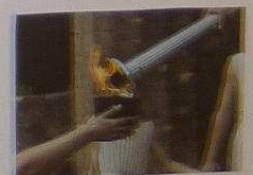
Olympic fire for Olympic games