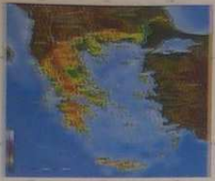
Topographical map of Greece.