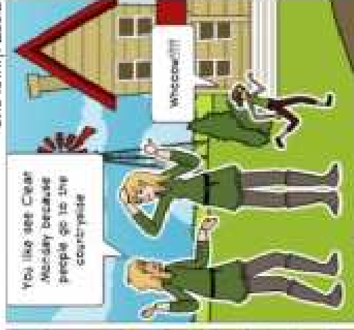
and today's Zoe D